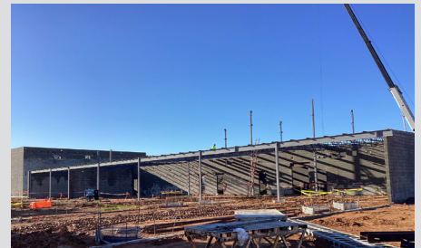
Structural steel erection at East elevation