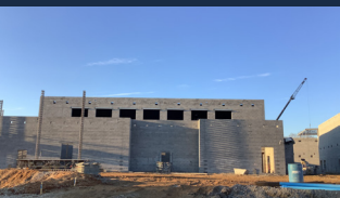
CMU wall completion (Area D)