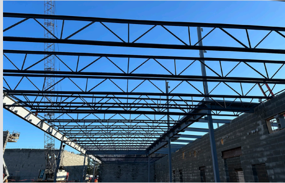
Bar joist installation at Area C (Classrooms)

The structural framework is progressing smoothly at the Eastman site! Steel plays a crucial role in providing strength and stability to the building, and comes in many forms. Beams and columns deliver essential load-bearing support, while joists and decking (corrugated steel sheets used for floors and roofs) are integrated to add strength and stability.