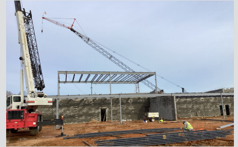
Bar joists set in Area C (Classrooms)

The structural framework is progressing smoothly at the Eastman site! Steel plays a crucial role in providing strength and stability to the building, and comes in many forms. Beams and columns deliver essential load-bearing support, while joists and decking (corrugated steel sheets used for floors and roofs) are integrated to add strength and stability.