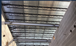
Decking installation (Area D)