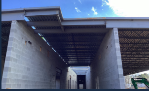
Decking installation at corridor (Area C)