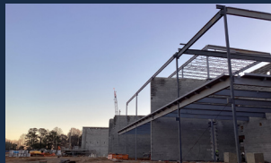
Steel erection (Area B)