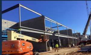
Erecting structural steel (Area B)