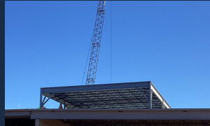
Decking installation (Area C Penthouse)